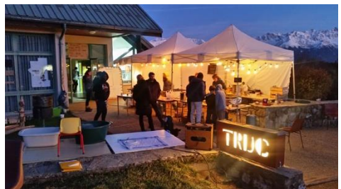
TRUC - Community coffee shop